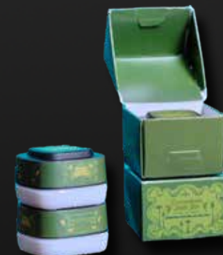
The Jewel Box

The Jewel's luxury look and feel expresses to your customers that a stunning product awaits inside.