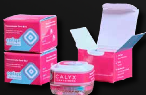
The Core Box

Efficiently store your product and communicate essential compliance information with this compact box.