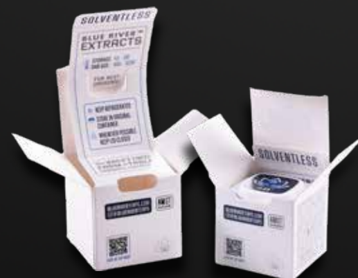
The Elevated Box

Elevate your product experience with a unique, built-in platform insert that nests the container inside.